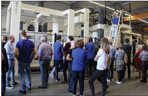
In early October SYMACH organised an open day at its plant at Terneuzen, the Netherlands, to demonstrate the company's latest developments in palletising and bagging technology (see p9).