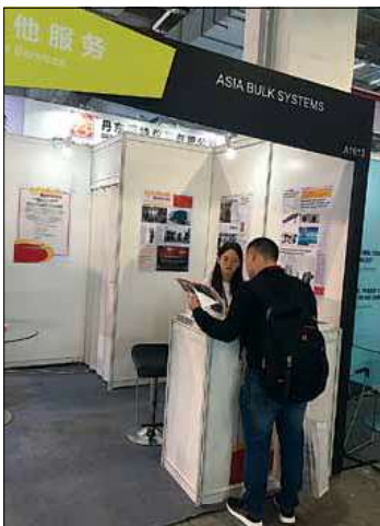
AsiaBulkSystems – the new sister publication to EuroBulkSystems which reports bulk handling, processing and transport developments throughout Asia, the Middle East and Australasia – was launched at two important trade shows taking place during two consecutive weeks in October: POWTECH India in Mumbai and, one week later, at IPB 2018 in Shanghai; the AsiaBulkSystems booth at the Chinese event is pictured left.