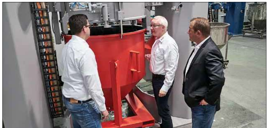
German engineering company MIXACO, which invented the container mixer in 1965, has continued to develop this specialist processing technology by customising it to suit the specific needs of its customers in Europe and overseas; for further details see p13.