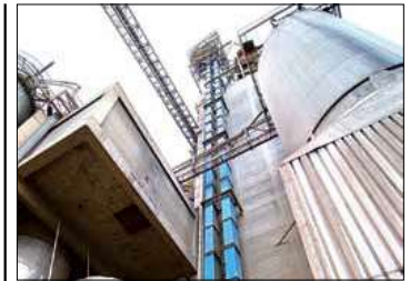
AUMUND continues to enjoy a fruitful relationship with the Turkish cement industry; AUMUND Beijing has just won a huge order to supply three belt bucket elevators (of the type pictured), five chain bucket elevators, seven pan conveyors and five drag chain conveyors, type LOUISE, all to be shipped to Limak Cimento later this year (see p11).